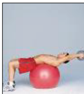
Figure 4: Abdominal Strengthening Exercises.